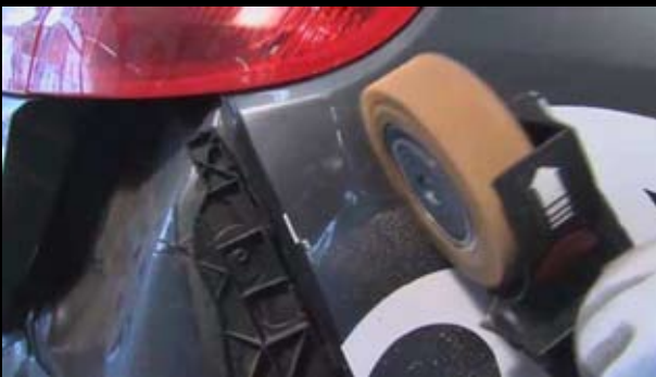
Removal of vinyl letters from vehicle

or directly on our website: www.monti.de/flash/vinzapper.html