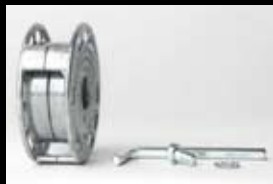
MBX® Adaptor System, 23mm Art.No. AS-009