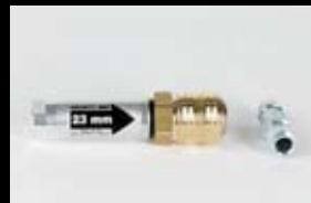
Air Pressure Regulator 23mm Art.No. ZU-071