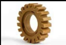
MBX® Vinyl Zapper Art.No. ZU-010-01