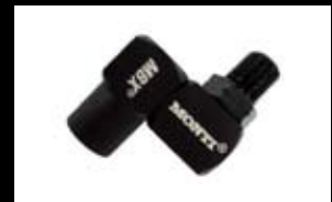
Swivel Connector for air supply Art.No. ZU-073