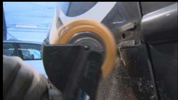
Removal of adhesive residues

The MBX® Vinyl Zapper is installed using a specially designed MBX® Adaptor system mounted onto either the MBX® pneumatic or electric drive units.